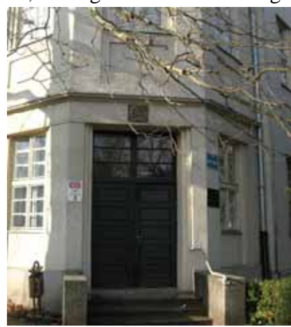
Figure 2 Gimnazija 'Sveti Sava'

GRAPES at the secondary school in Prijedor. Before going there, we had sent some information and examples for the use of GRAPES in mathematics teaching. The class itself, 3<sup>rd</sup> year mathematics of secondary school<sup>3</sup>, was planed by the teacher. The class of students under observation had already been introduced to the use of GRAPES. In what follows a global view of this experimental class is given. Details, the plan and worksheets for the class, can be found in the appendix to this paper.